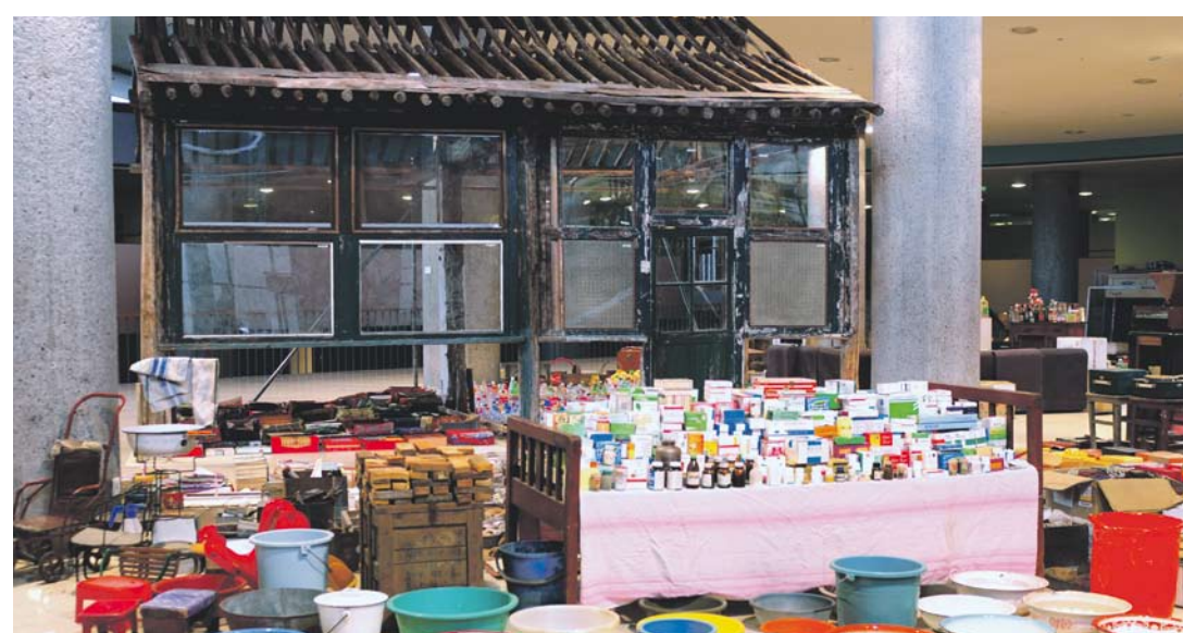
You can never have too many rice bowls: Song Dong's installation "Waste not."

Ulrike Münter is a freelance journalist living in Berlin.